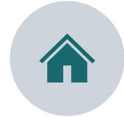
FRANKLIN SHELTER 60 BEDS

81,043 Nights of Shelter Provided in 2024