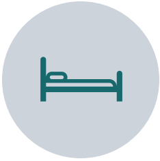
STEPPING STONE 56 BEDS