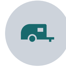
SAFE PARKING SITES 21 BEDS