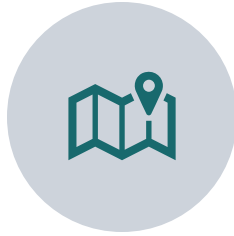
NAVIGATION CENTER 100 BEDS