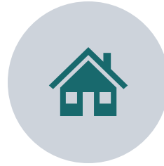
CENTRAL OREGON VILLAGES 20 UNITS