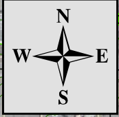
Figure 2 Franklin Avenue Area